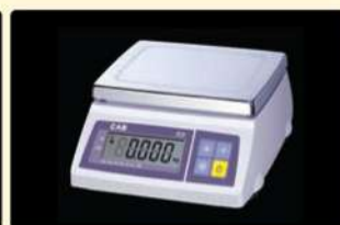
Stainless steel platter ▲