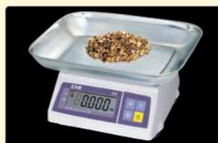
Fish tray ▲