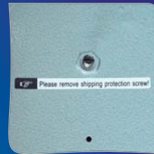
Load Cell protection screw