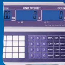
24 PLUs' Direct memory key & User-friendly keypad