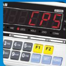
High-visibility LED display