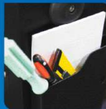
2 Storage boxes