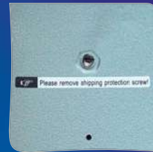
Load Cell protection screw