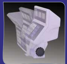
Pivot & Tilt indicator