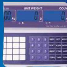
24 PLUs' Direct memory key & User-friendly keypad