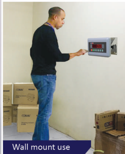
Wall mount use