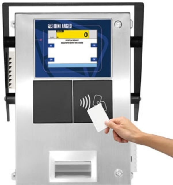
3590EGTBOX8: with RFID card reader.